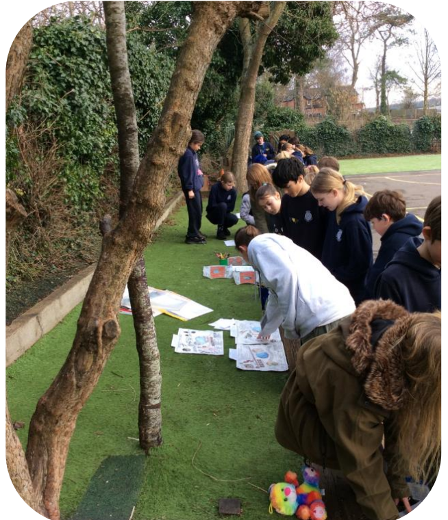
Oak Class reviewing plans for developing our pond area with Sparsholt Agricultural College students