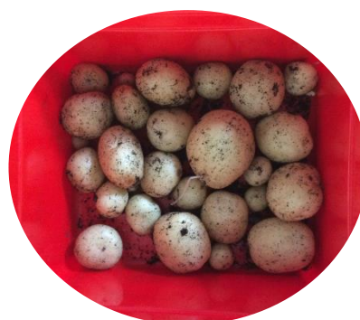
Growing potatoes with Beech Class!