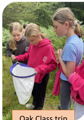
Oak Class trip to Cameron's Cottage