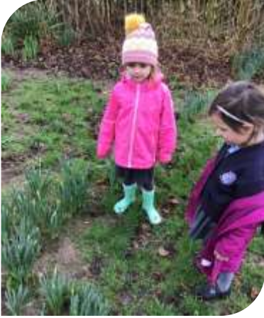
Wellbeing Wednesday Wellbeing walk around the grounds!