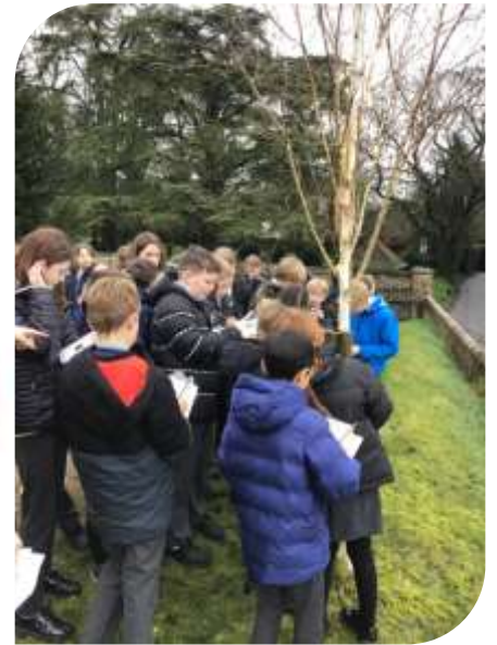
Thoughtful Thursday Whole school scavenger hunt!