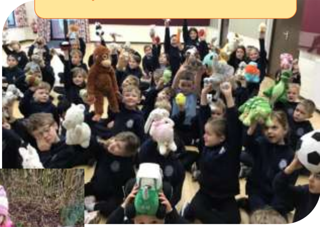
Mindful Me Monday Soft toy buddies take over the school!