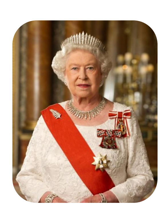
A LIFE IN SERVICE

Queen Elizabeth II April 21, 1926 – September 8, 2022