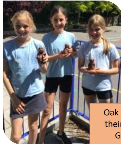
Oak Class with their Anthony Gormley statuettes