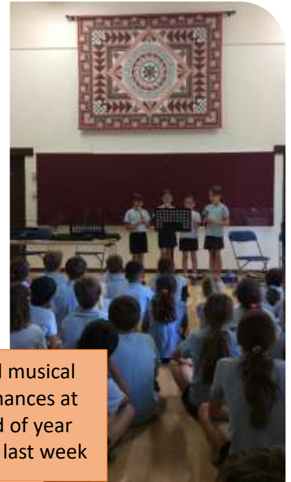
Magical musical performances at the end of year concerts last week