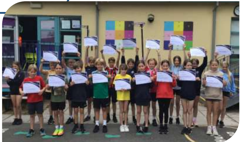
Year 5 return from Henry Beaufort Sports Festival