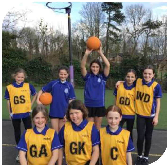
Sparsholt Netball Team competing in their first netball tournament