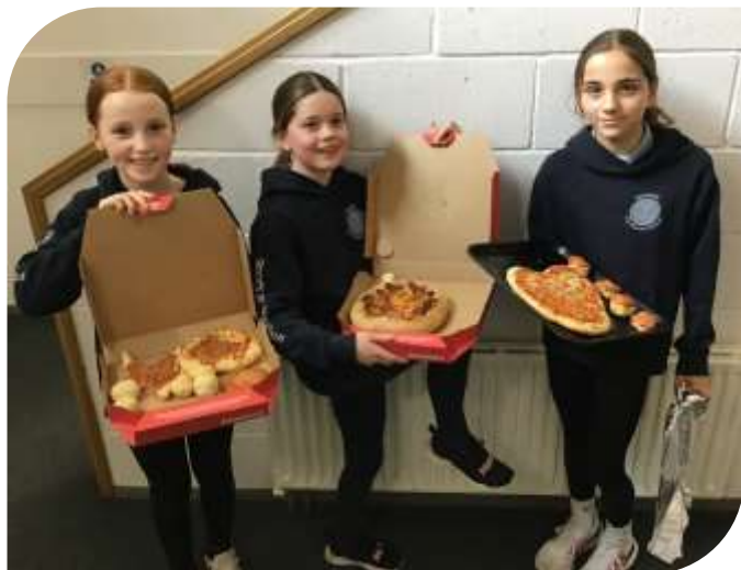
Oak Class pizza-making – thank you for FoSS for our cooking facilities!