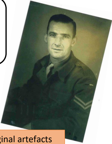
Original artefacts from Oak Class families