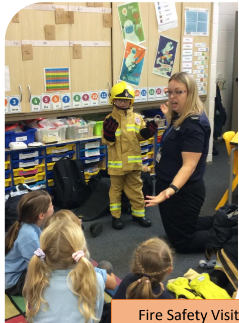
Fire Safety Visit