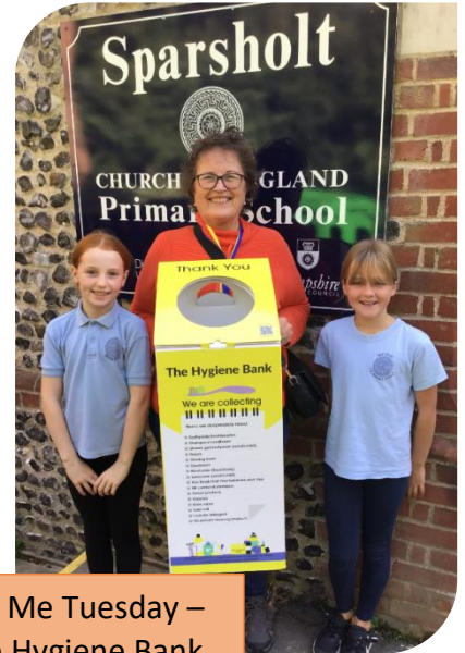
Tell Me Tuesday – The Hygiene Bank