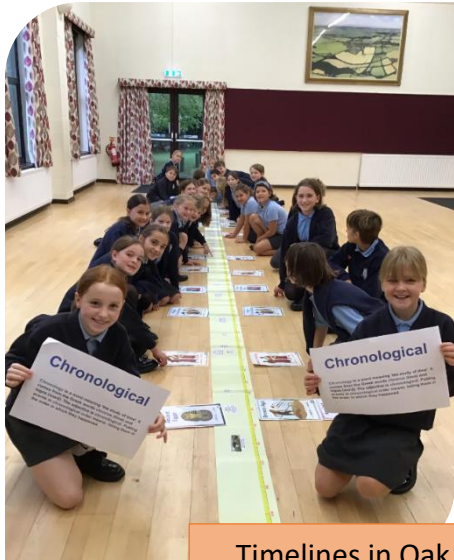
Timelines in Oak Class