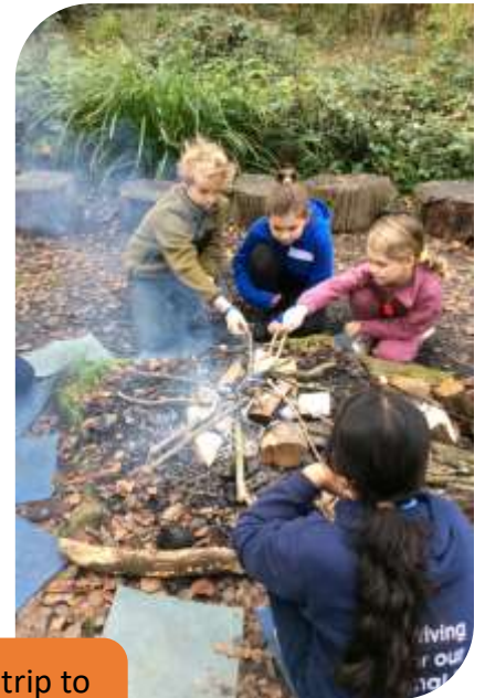
Rowan Class trip to Hilliers