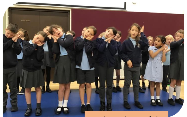
What a beautiful Harvest Festival!