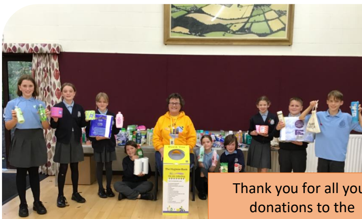
Thank you for all your donations to the Winchester Hygiene Bank