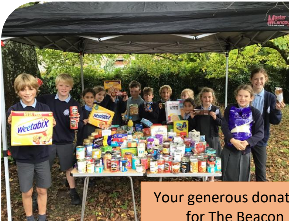
Your generous donations for The Beacon