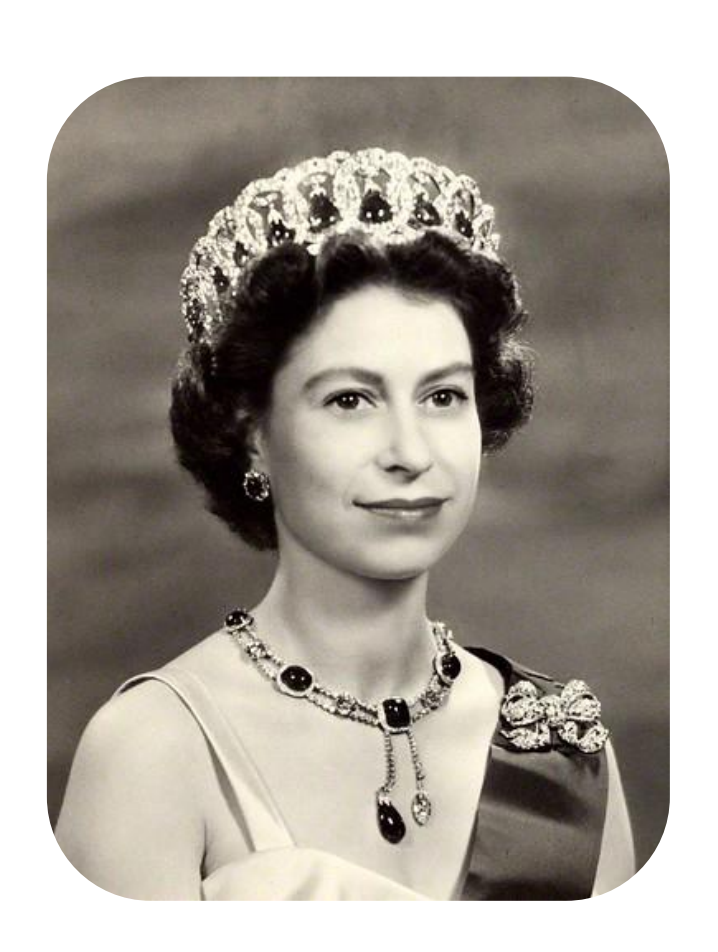
A LIFE IN SERVICE

Queen Elizabeth II April 21, 1926 – September 8, 2022