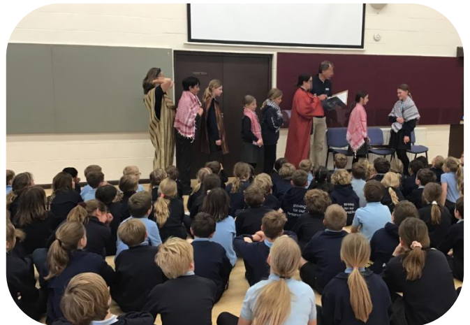
Christ Church Assembly