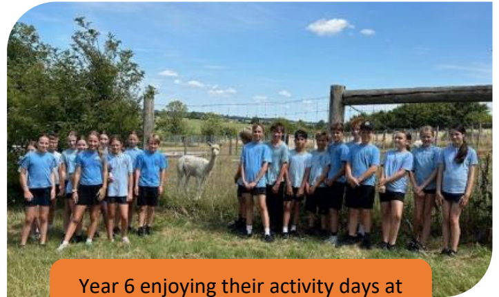
Year 6 enjoying their activity days at Sparsholt Agricultural College