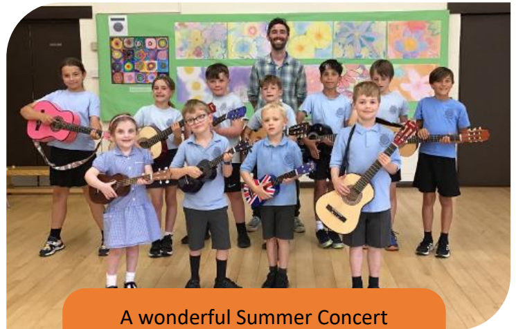
A wonderful Summer Concert performed by pupils having guitar and ukulele lessons with Winchester Academy of Modern Music