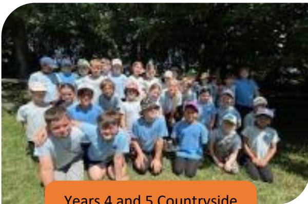
Years 4 and 5 Countryside Day at Farleigh Wallop